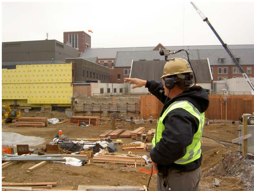
Figure 1 – Wireless Webcam Tour Guide