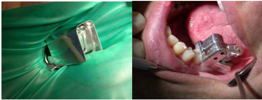
Figure 3. Machine model showing how it fits in the patient's mouth: to the left is the machine placed together with a rubber dam. The machine is protected by a stainless steel cover. To the right is the machine without cover or rubber dam, showing the relationship in size to the teeth.